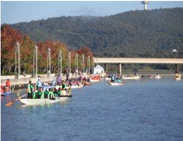
Australian Championships, 3 April 2011

PO Box 7191, Yarralumla ACT 2600 • DRAGONSABREAST.COM.AU • ISSUE 40 • MAY 2011