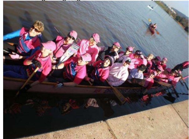
Mothers Day Classic 8 May 2011

Larissa said: I loved seeing you all in the boat, you looked wonderful. The crowd loved it and I could see them looking and going down for a closer inspection!