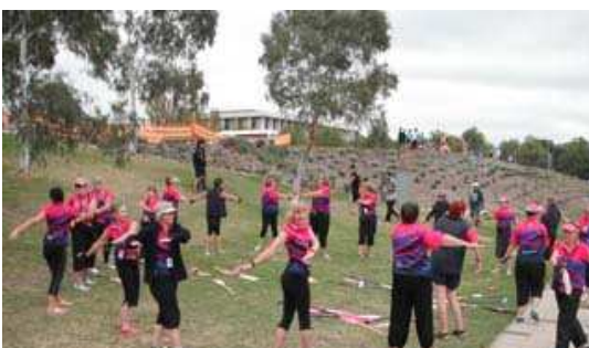
Warming up, DA ACT, Australian Championships, 1 April 2011