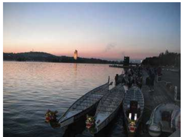
Sunrise, National Carillon, Australian Championships, 3 April 2011