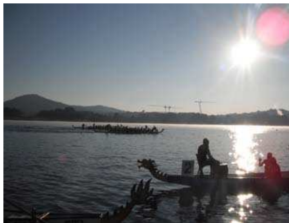
Australian Championships, 2 April 2011