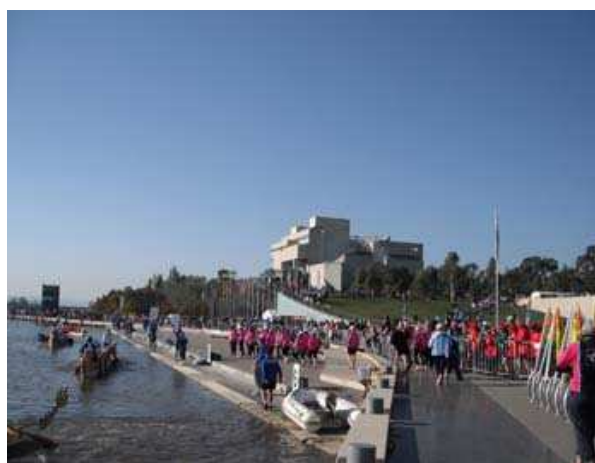
Australian Championships, 2 April 2011