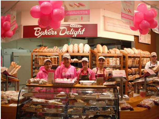
Bakers Delight Civic ACT 6 May 2011