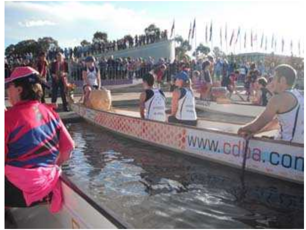
Dotting of the eye ceremony, Commonwealth Place, 30 March 2011