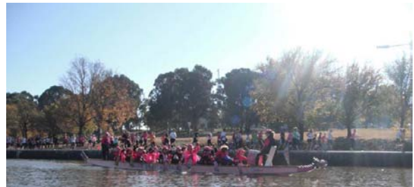
Mothers Day Classic 8 May 2011