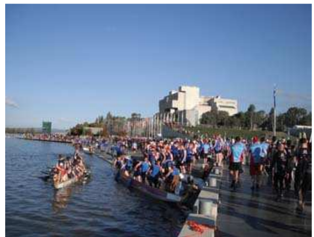
Australian Championships, 3 April 2011