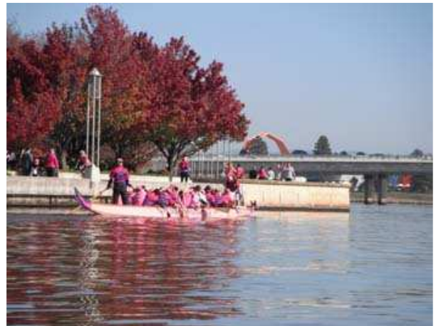
Mothers Day Classic 8 May 2011