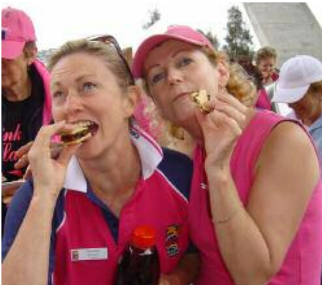
Below: Setting out the munchies