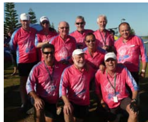
Some of the DASzlers men who took part in the club championships.

Over the next three days of club vs club racing we put in some great performances although,