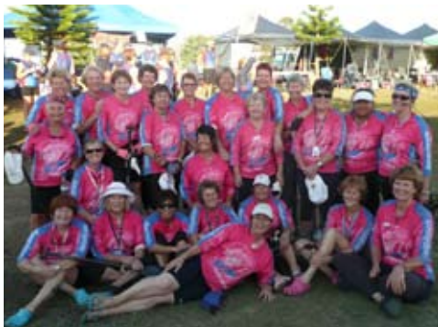
The GM Womens Team – all smiles.

Heartfelt thanks goes to our GM menfolk, who good-naturedly paddled out of their age group to give our younger members (Masters are all under 50) some racing excitement too.