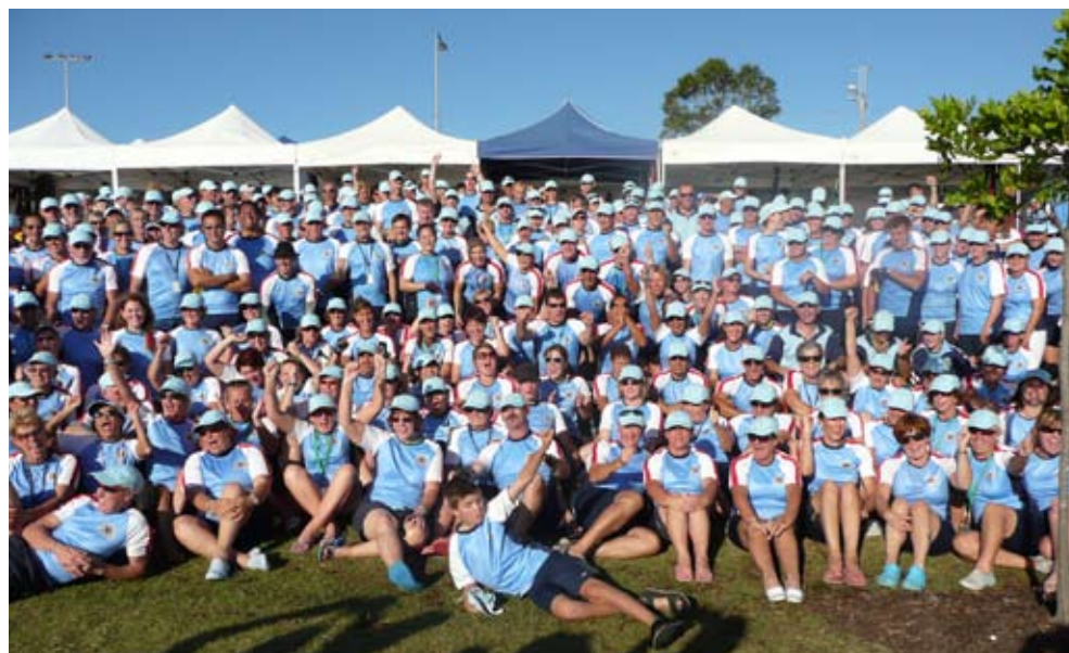
A sea of pale blue. The NSW State Team at the Nationals.