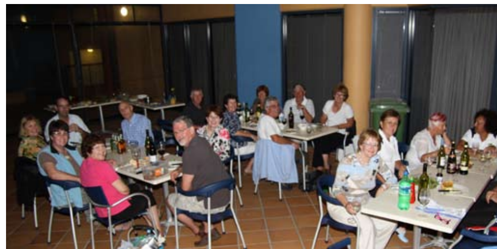
The Anzac Day barbecue at Breakfree (is that a spare chair on the right?)

There were many laughs, great friends and a smorgasbord of food ... not to mention that large puddle of red wine that would not go away!