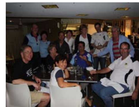
DASzlers enjoying another one of their favourite pastimes.