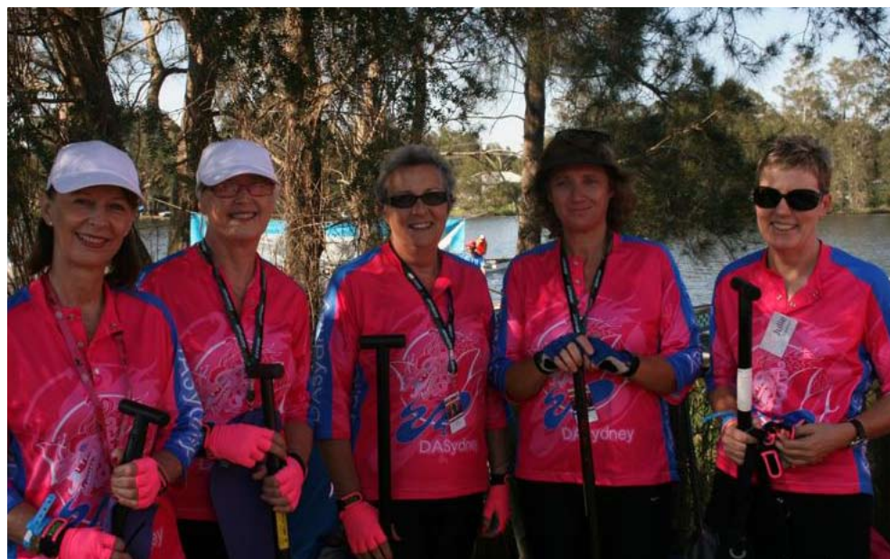
"Virgin" racers at Tacoma