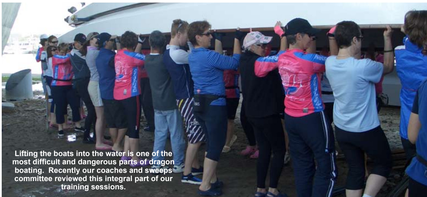
Lifting the boats into the water is one of the most difficult and dangerous parts of dragon boating. Recently our coaches and sweeps committee reviewed this integral part of our training sessions.