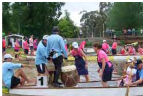
Everyone lent hand at the regatta.