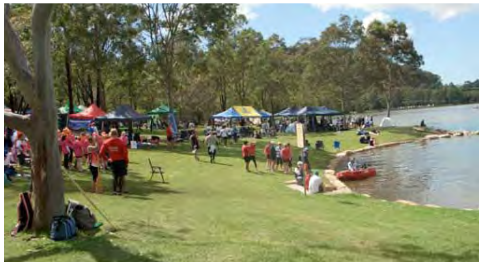
The beautiful surroundings at Roseville make for a very relaxing day (above), despite some very novel boarding techniques at the beginning of the day (below).

And just when you thought you had experienced all that dragon boating regattas had to offer, a very high tide meant we had to learn to abseil down a very steep bank to load the boats. It's a good thing we are all so young and agile!