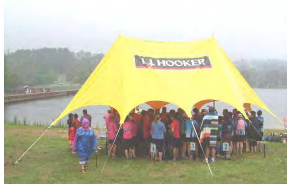
The weather held until the last hour of the regatta at Orange, but there was shelter on hand.