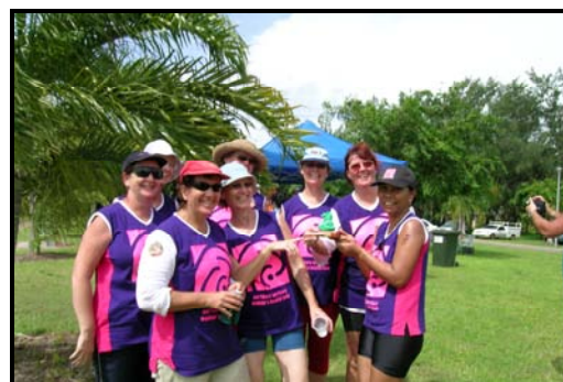
Breast Effort Team from the Department of Health and Community Services - Harmony Day regatta

The 2004 IDBF 5 th WDBRC will take place at the Dianshan Lake, Qingpu District, Shanghai, China from 20 to 24, October 2004. The Opening Ceremony will be held on the 20 October 2004, with Championship Racing from 21 to 24 October inclusive. Provisional Entry Forms must be with the Organising Committee by no later than 1 May 2004 – so any Pink Paddlers from the NT wanting to paddle in this event need to let me know immediately, so I can advise AusDBF of how many teams we will have.