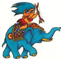
Amazon Heart Odyssey

Applications for our latest amazing adventure, the Amazon Heart Odyssey Montana 2006 have just opened!