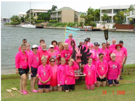
left DBNT Australia Day Regatta – in our new rashies).