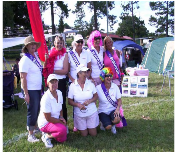
RDA Relay for Life team

In March, sixteen of our club members took part in the Cancer Council's Relay for Life at the Bangalow Show Grounds. It was a great afternoon/evening for walking. What an inspiration it was to see so many survivors walking with their supporters!