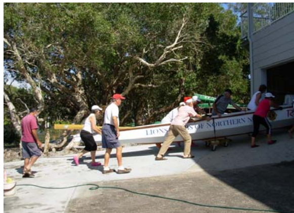
our new boat is safely tucked away in the new shed