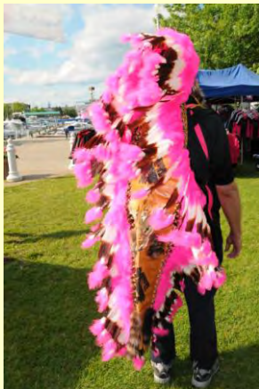
B1 modelling the latest in Paddling gear from Canada