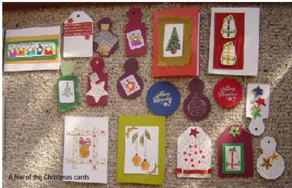
A few of the Christmas cards

We were all so involved we forgot morning tea and only belatedly stopped to have lunch out on the deck and pre-sample the new pink and white M&Ms.