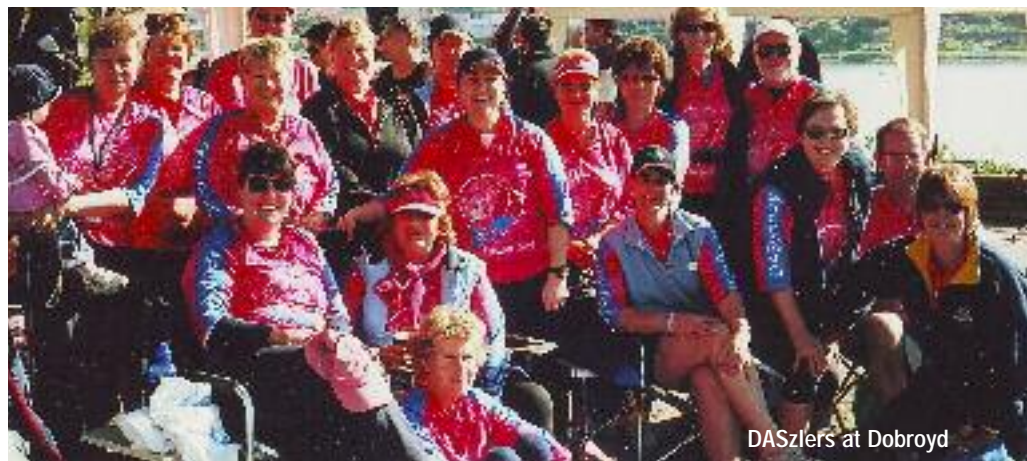
DASzlers at Dobroyd