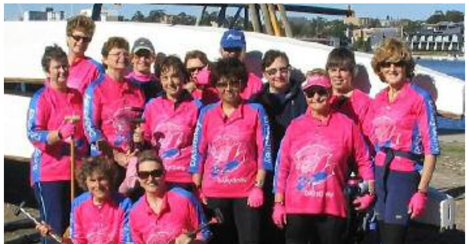
These were the mugs who braved the City2Surf

We did see many other groups – including