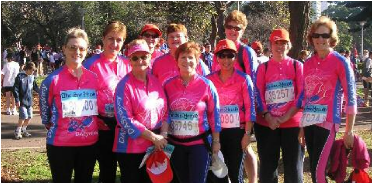
Some of the DASydney City2Surfers at the start