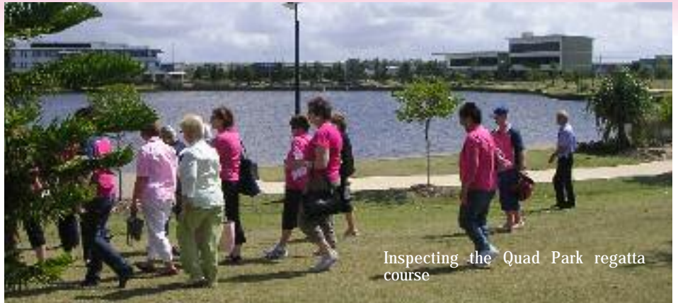
Inspecting the Quad Park regatta course

Anyone who knows me well will know how much I hate to miss a paddle, so it was somewhat reluctantly that I headed up to Caloundra the first weekend in September for the DAA AGM. Of course once I got there it was great to see the directors and other coordinators, to swap notes, pick their brains and just enjoy their company. Turns out it was a very valuable weekend. As always, I learned a lot, particularly about Abreast in Australia, which I'm