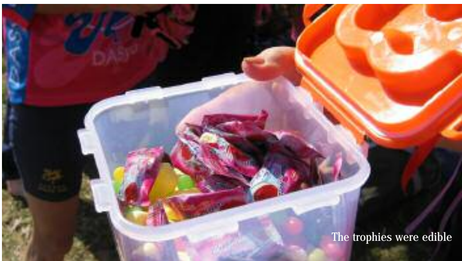
The trophies were edible