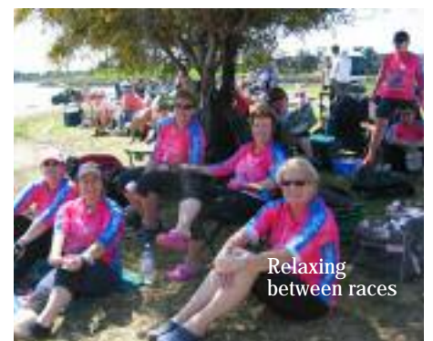
Relaxing between races

disgorge our first group of paddlers we all burst into "song" with: