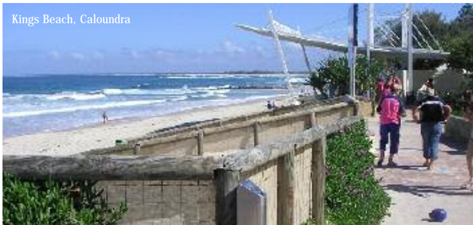
Kings Beach, Caloundra