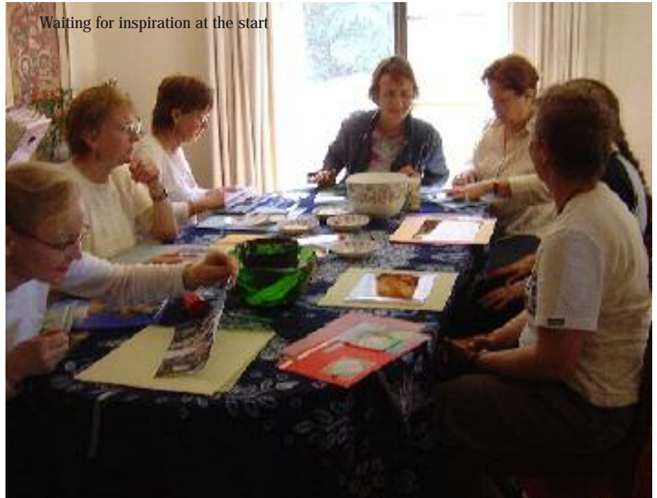
Waiting for inspiration at the start