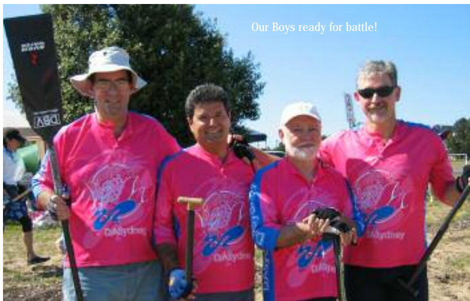
Our Boys ready for battle!