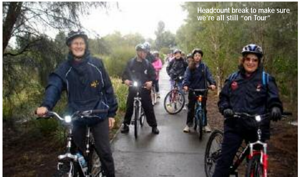
Headcount break to make sure we're all still "on Tour"