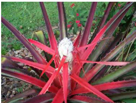
One of our bromeliads in bloom