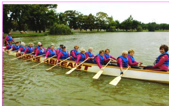
DA Bendigo paddlers on Lake Weeroona